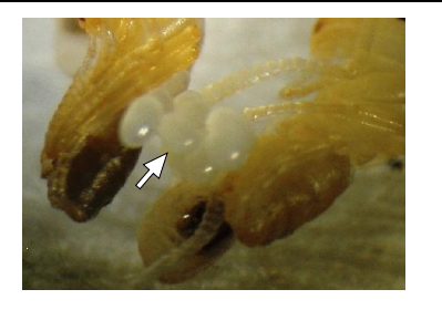
Cluster of ant eggs

Eggs -Queens lay both fertilized and unfertilized eggs. Most are fertilized and become female workers. A few of the fertilized eggs become queens. The few unfertilized eggs are male. Eggs are tended by workers. (Click images to enlarge or orange text for more information.)