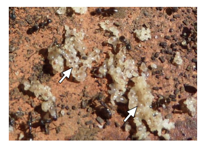
Larvae regurgitate liquid food for the colony

Pupae –All have a pupal stage, during which the adult form develops. Only males and queens will develop wings. All are exarate pupae, in which the appendages are free and visible. (Click images to enlarge or orange text for more information.)