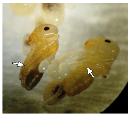
Exarate pupae Appendages loose

Pupae –All have a pupal stage, during which the adult form develops. Only males and queens will develop wings. All are exarate pupae, in which the appendages are free and visible. (Click images to enlarge or orange text for more information.)