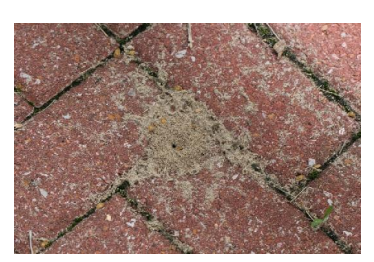
Ants are as important as earthworms in soil aeration

images to enlarge or orange text for more information.)