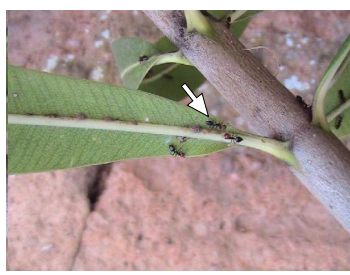
Ants also herd scale insects for honeydew