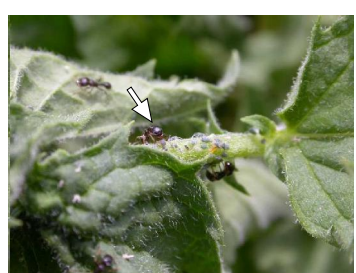
Ants protect aphids for honeydew

Comments –Ants are classified in the order Hymenoptera, Suborder Aculeata, Superfamily Vespoidea, Family Formicidae.