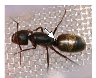
Node on waist