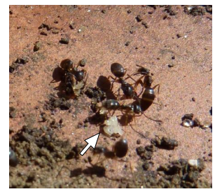
Workers tending eggs

Larvae –All are vermiform (worm-like), so they have no legs, no prolegs, no wings, no wingbuds. Heads are difficult to discern. The larvae are the only members of the colony that can ingest solid food, which they regurgitate for the workers to distribute; however they do not create frass. Unable to move on their own, they are transported and tended by workers. (Click images to enlarge or orange text for more information.)