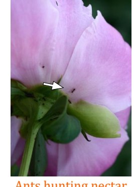
Ants hunting nectar are pollinators