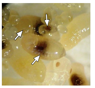
Vermiform (worm-like): no legs, no prolegs

Larvae –All are vermiform (worm-like), so they have no legs, no prolegs, no wings, no wingbuds. Heads are difficult to discern. The larvae are the only members of the colony that can ingest solid food, which they regurgitate for the workers to distribute; however they do not create frass. Unable to move on their own, they are transported and tended by workers. (Click images to enlarge or orange text for more information.)